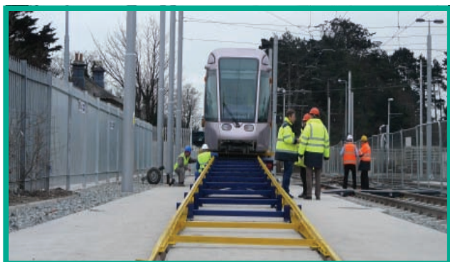
First 43 Metre Tram to Ireland

February has seen a milestone in the project with the delivery of the first of the new 43m trams. These trams are 100% low floor for improved passenger mobility.