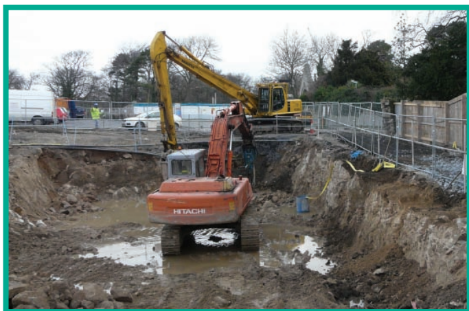
Glencairn - Breaking Ground