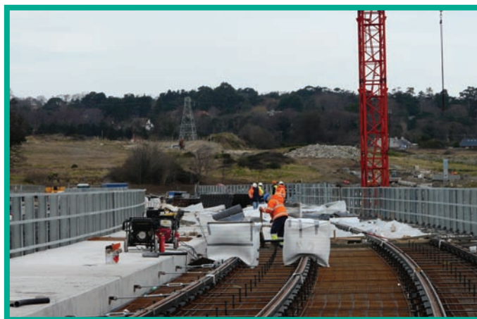
Laughanstown - Laying the Track