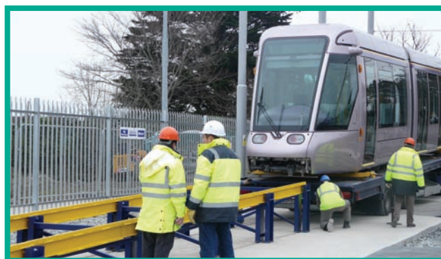
First 43 Metre Tram to Ireland

Please note when you submit your contact details you agree to be added to the RPA Public Consultation Database. To remove your details from the Database simply send us an email to info@rpa.ie . All contact information provided to RPA will be treated as confidential; see www.rpa.ie for details of RPA Privacy Policy.