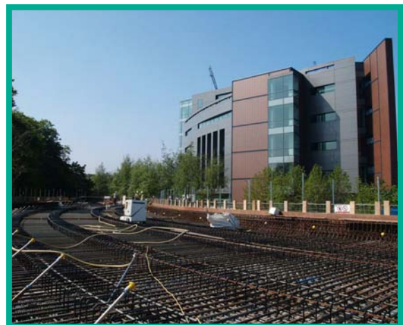
Structural Steel Erection over Brewery Road Roundabout