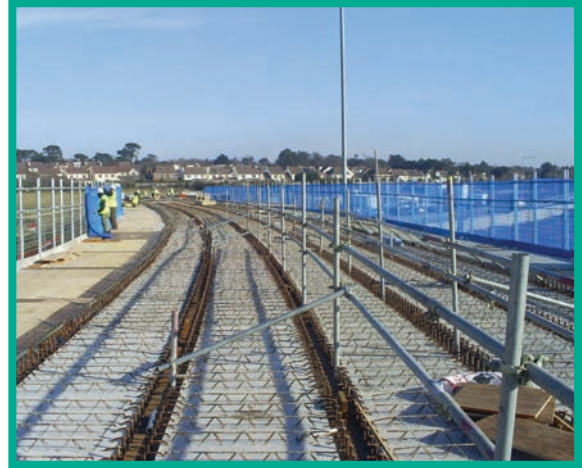
Steel fixing on Carrickmines Bridge