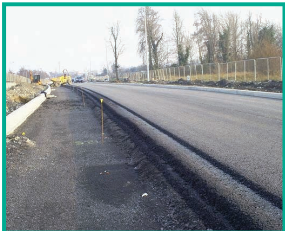
Finished road construction (right side) on Ballyogan Road

The construction of the new carriageways, cycle-lanes and footpaths continues. The portion of Ballyogan Road outside Ballyogan Wood will be diverted onto the new carriageway this month. A speed limit of 30 kph will be in place on the temporary surfacing. This speed limit will be enforceable by the Gardaí. The temporary traffic lights will be moved along Ballyogan Road towards Ballyogan Avenue this month. This will allow the removal of the existing footpath on the north side of the road and the installation of a new, wider carriageway. Pedestrians are requested to obey the temporary direction signs.