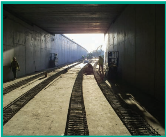
Spine Road Underpass nearing completion

Following the completion of the structural steel installation in March all Luas related traffic management restrictions have now been removed from Wyattville Link Road. Works are progressing well on the viaduct and the structure will be ready for track installation shortly. The remaining works in this area will have minimal impact on traffic movement.