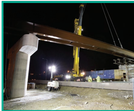
Leopardstown Bridge, Steel lift over the M50

Construction of the Luas Bridge over the M50 at Leopardstown continues to progress well with all of the structural steel erection complete and works to the concrete deck and parapets continuing at pace.