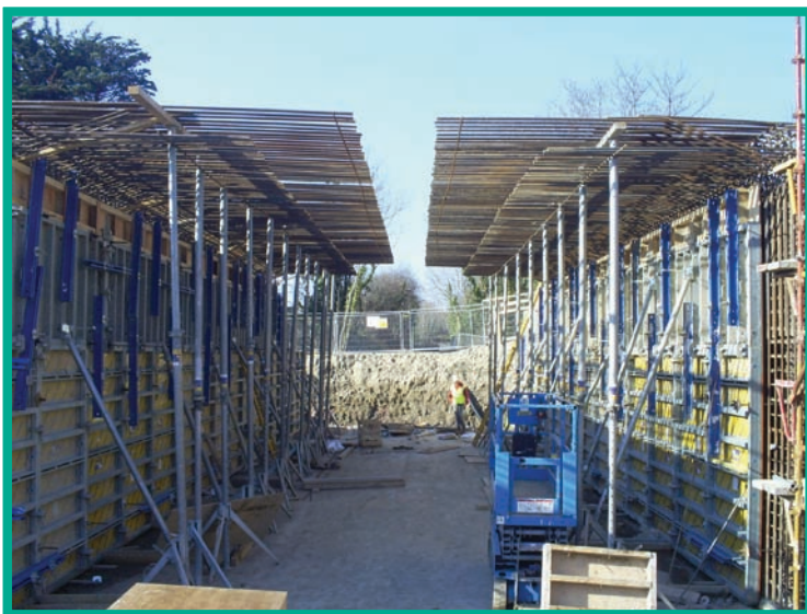
Formwork for wall pours on Glenamuck Bridge

Works are progressing well at Glenamuck Road and Bridge and it is envisaged that the road will be partially open to vehicular and pedestrian traffic at the end of May, however we are working to a very demanding timeframe in this instance. We are delighted to be re-opening the access to this area ahead of schedule. We would like to thank all concerned for your patience and forbearance during the upgrading works. Whilst the temporary pedestrian access remains in place, please note that for safety reasons, all cyclists must dismount from their bicycles. Mopeds and motorised vehicles are not permitted at anytime on the temporary pedestrian access.