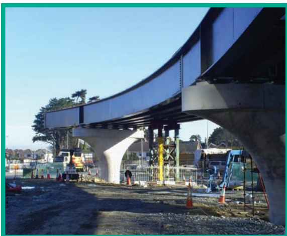
Structural Steel Erection over Brewery Road Roundabout

All of the structural steelwork erection for Brewery Road Bridge has been completed and works on the construction of the concrete deck and parapets are in progress. No significant traffic restrictions are envisaged for these works.