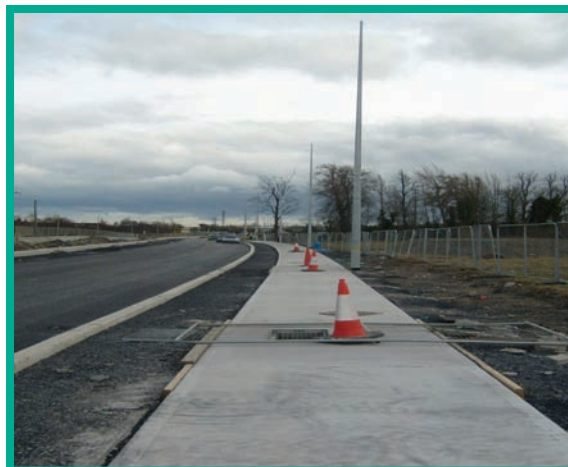
Footway and Public Lighting Installed Ballyogan Road