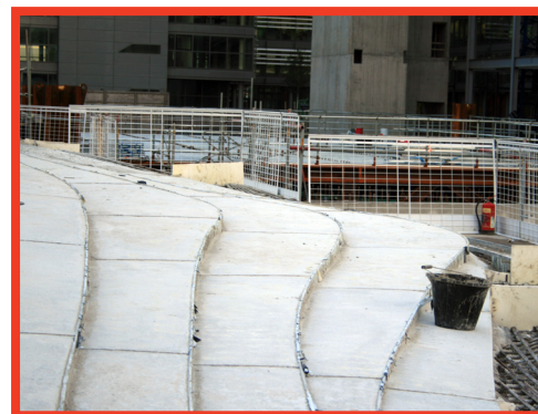
Spencer Dock Bridge Viewing Galleries