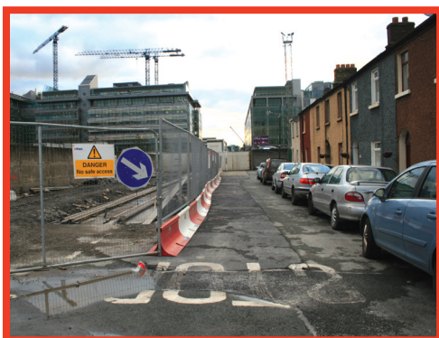
Track Works Upper Mayor Street

Heading from Sheriff Street to Castleforbes Road, there is two-way traffic up to the junction with Mayor Street Upper and there is access only through the junction one way southbound (in the direction of the Quays.) There is no through traffic from the Quays to Sheriff Street along Castleforbes Road.