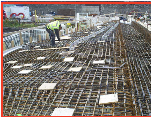
Spencer Dock Bridge