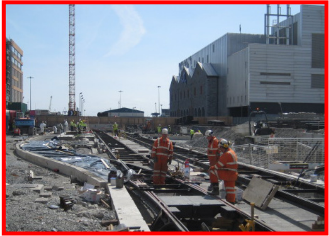
The Point Stop

Please note when you submit your contact details you agree to be added to the RPA Public Consultation Database. To remove your details from the Database simply send us an email to info@rpa.ie . All contact information provided to RPA will be treated as confidential; see www.rpa.ie <out-bind://187/Local%20Settings/Temporary%20Internet%20Files/OLK54/www.rpa.ie> for details of RPA Privacy Policy.