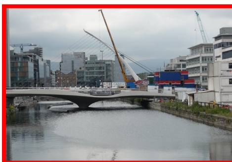
Spencer Dock Bridge

The Spencer Dock Bridge was opened to pedestrians in May. From 4pm on 16 June 2009 onwards the bridge will be open to westbound vehicular traffic exiting from Spencer Dock. Vehicles using this route to exit from Spencer Dock will be required to turn left (southbound) onto Guild Street in the direction of North Wall Quay.