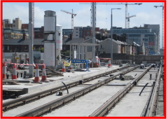
Spencer Dock Stop