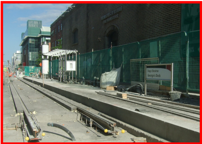
Georges Dock Stop

CONSTRUCTION OF THE FOUR LUAS STOPS ON THE DOCKLANDS LINE IS ONGOING