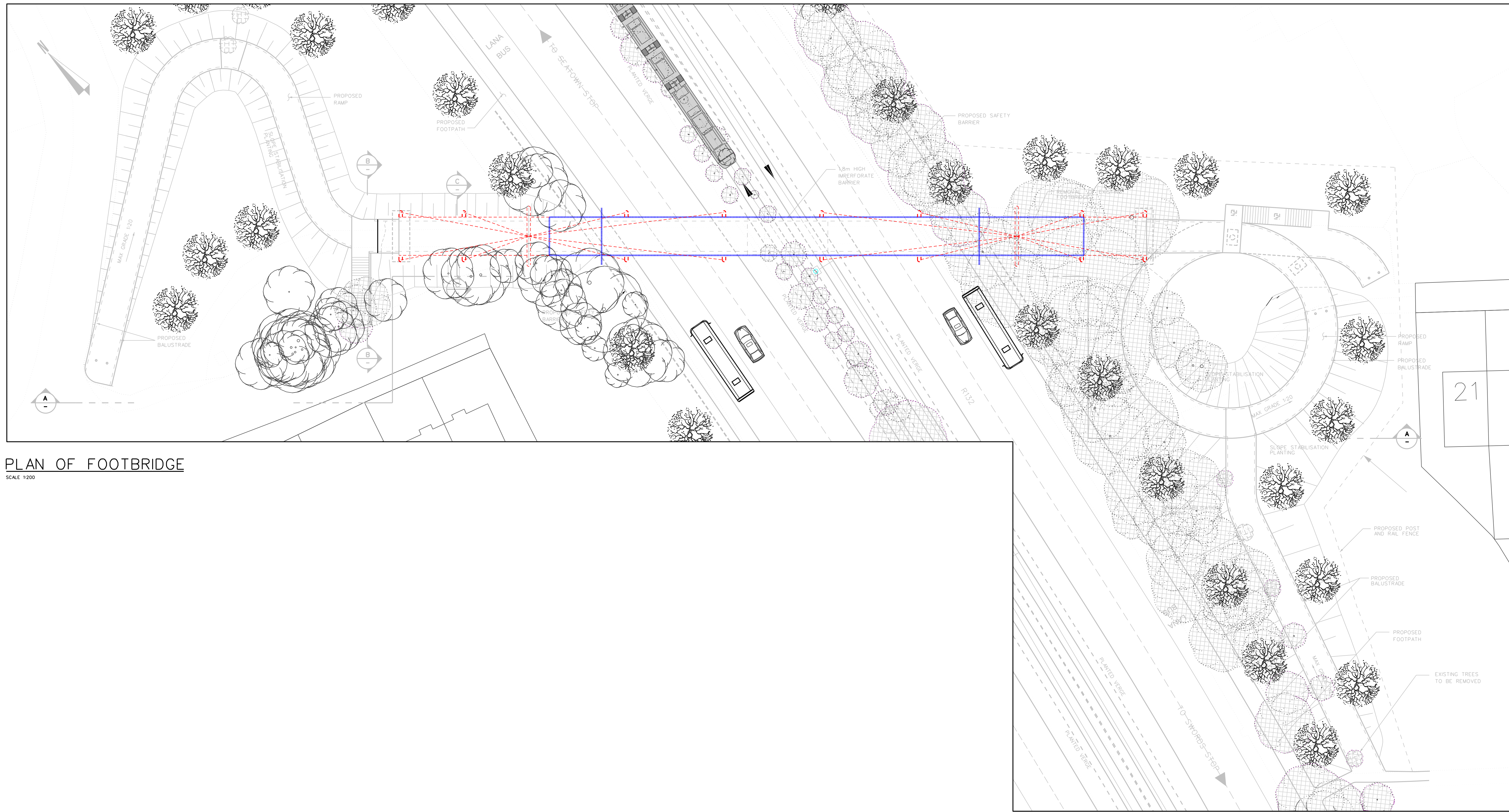
PLAN OF FOOTBRIDGE SCALE 1:200

NOTE: TEMPORARY PEDESTRIAN CROSSING TO BE PROVIDED FOR THE DURATION OF CONSTRUCTION