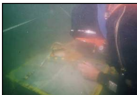
Recording prehistoric logboat at Gormanston, Co. Meath GAS 2025 Irish Sea Interconnector