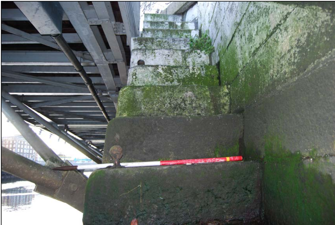
Plate 32: East-facing detail shot of masonry steps providing access to the river from Eden Quay (Feature 3); 1m scale.