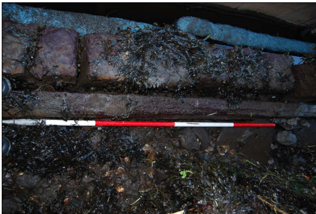
Plate 28: Plan view of timber vertical timber piles (Type A) and adjacent horizontal timbers (Type F); 2m scale.