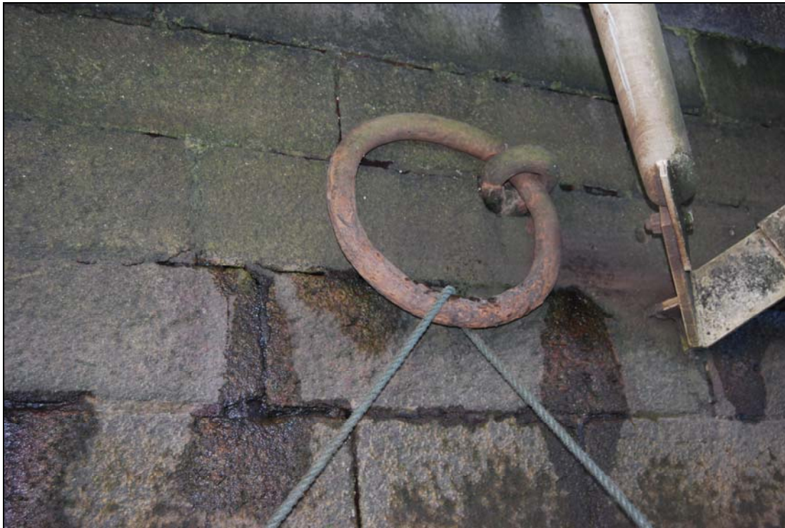
Plate 30: Detail shot of iron mooring hoop located along HWM of Eden Quay (Feature 3).