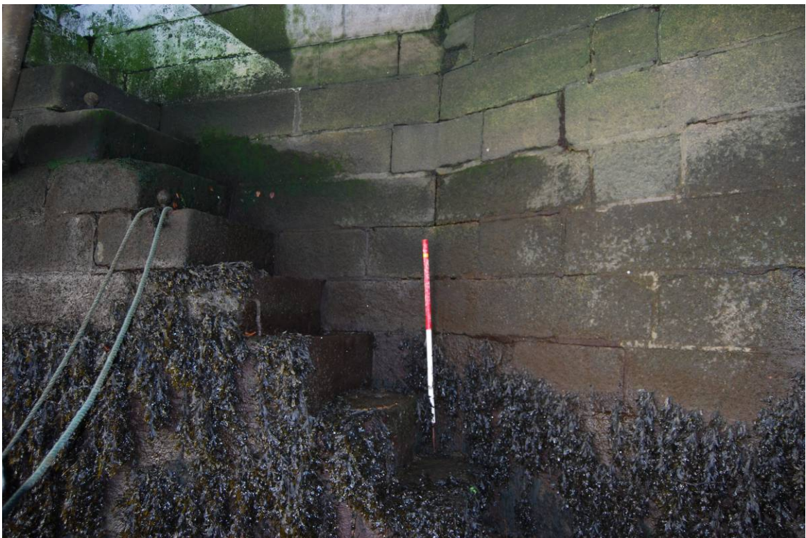
Plate 33: North-facing view of masonry steps providing access to the river from Eden Quay (Feature 3); 1m scale.