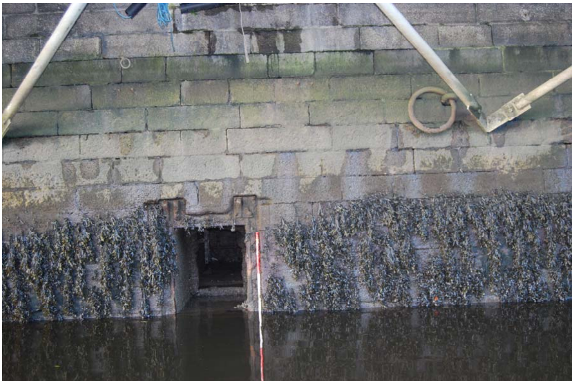
Plate 31: North-facing view of nineteenth-century drain located along the base of Eden Quay (Feature 3); 1m scale.