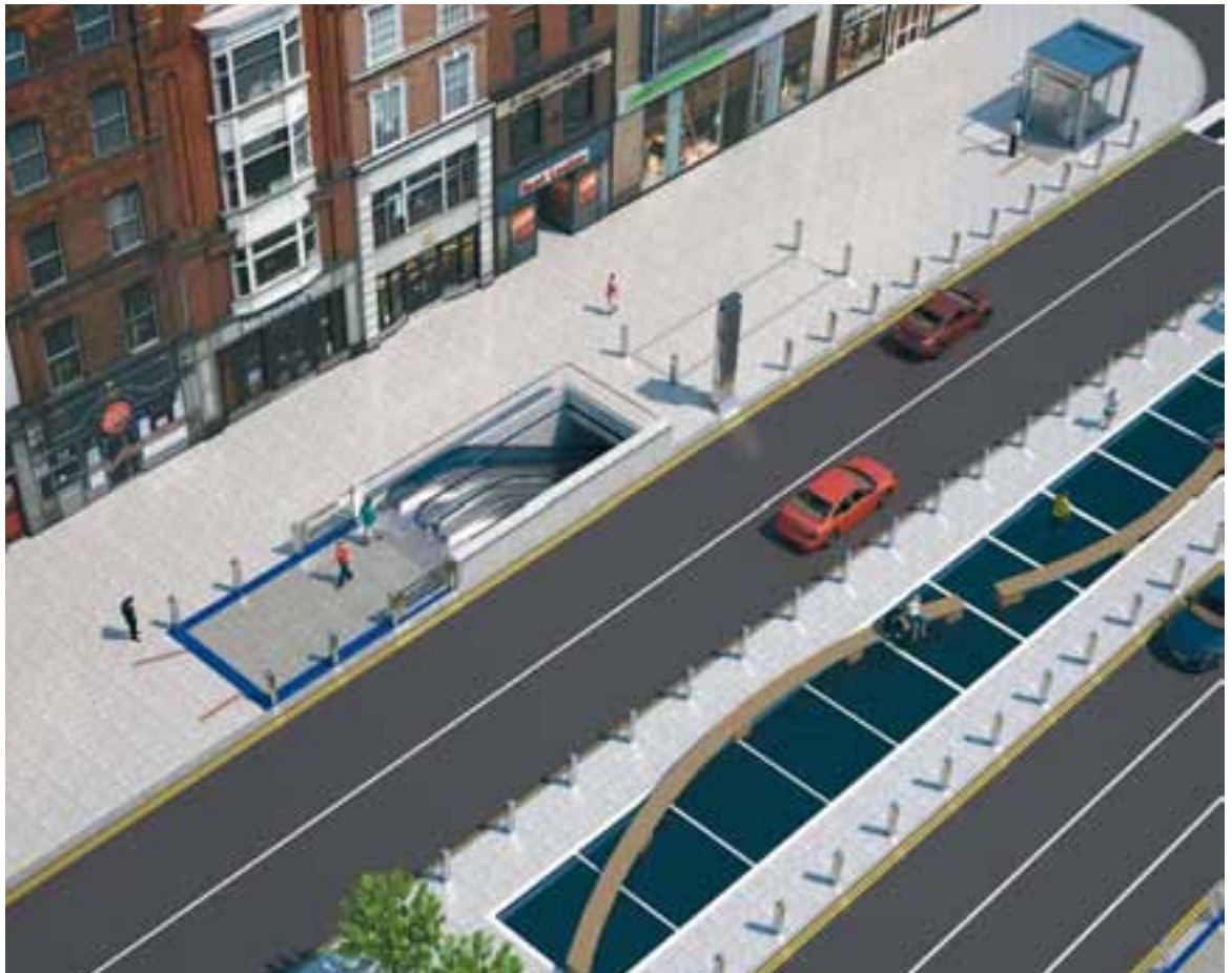
O'Connell Bridge Stop (escalator and lift -aerial view)

However, the construction of the proposed scheme over the five year programme will result in some negative socio-economic impacts. These will be focused on the areas of retail, commercial and office-based employment, where access to/from these areas is likely to be impacted by temporary delays and disruption. These areas are Westmoreland Street, O'Connell Bridge, O'Connell Street and Ballymun. There will be wider impacts in relation to traffic congestion and longer journey times during construction. These short-term impacts are detailed further in the Traffic section.