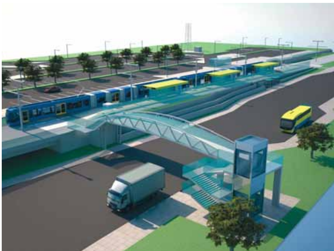
Fosterstown Stop and Park & Ride

The alignment emerges from the underpass, passes under a new accommodation bridge serving a local business at Fosterstown, to rise to the surface and onto embankments through a greenfield area. A turn back facility is provided in this area to the north of the airport to allow some metro services to reverse at the airport in the future. A new agricultural underpass is located beneath the turn back facility. The turn back facility marks the end of Area MN102.