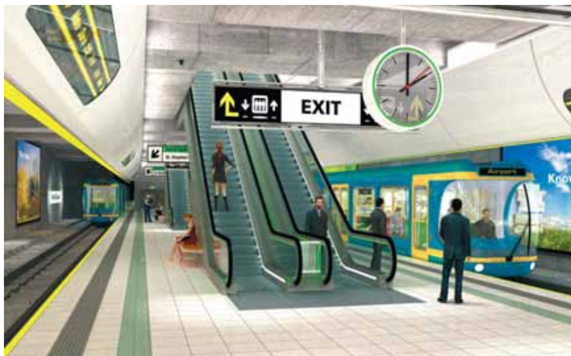
Parnell Square Stop (platform level)

No adverse effect on human health is predicted from changes in radon levels as local geology makes a detrimental change in radon levels unlikely. In the event that it would occur it will be detected by monitoring being carried out in the construction phase. If necessary, mitigation measures will be put in place.